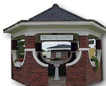
Mineral Springs Park

Anspach Stage: Built during the depression/Renovated in 2004